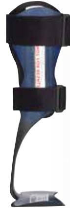
KiddieROCKER® Youth Sizes