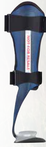
BlueROCKER® 2½ BlueROCKER® 2.0

Offered individually or in convenient "6-PACKS" (sizes small, medium and large – left and right).