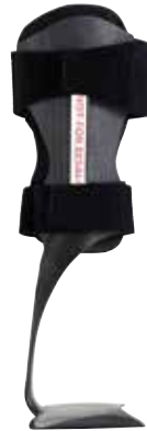
KiddieFLOW™ Youth Sizes

Allard also offers AFOs that are designed to be used as initial assessment tools to evaluate functional improvement, patient acceptance and as a gauge to decide which Allard AFO will work best for the patient as well as what modifications will be necessary to optimize the patient's gait pattern. Those are labeled "Not for resale".