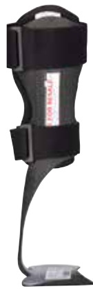
KiddieGAIT® Youth Sizes