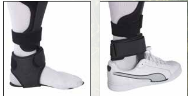
For Pes Valgus Control

Kit that includes lateral wedge and heel wedges. Posting wedges are used for correcting or adjusting medial & lateral slopes. Pressure Sensitive Adhesive (PSA) Backed EVA Foam. All wedges are Shore A60 Durometer.