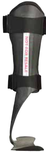
ToeOFF® FLOW 2½ ToeOFF® 2½ ToeOFF® 2.0