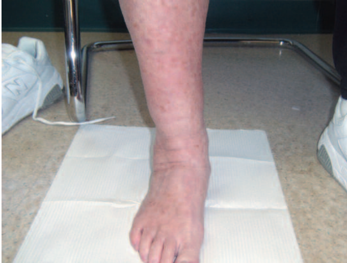
Figure 1. Patient non weight bearing. Anterior view showing Grade 3 PTTD, with subtalar joint swelling and forefoot eversion. (The same patient is featured in all figures.)

tibia progresses over the fixed foot, thereby providing additional decelerating effect of pronatory forces and preparing the foot to reposition into supination for more effective and efficient propulsion during the third rocker. So loading and unloading of the posterior tibialis muscle occurs earlier and later in the closed chain phases of gait when the foot engages the ground and again when it leaves the ground. It is the only dual-phase muscle in the plantar flexor group.