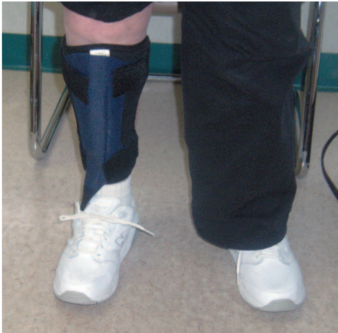
Figure 4. Patient weight bearing, anterior view, with finished FRECO Blue rocker and New Balance walking shoe to aid in third rocker function. Noticed improved forefoot, ankle and knee alignment in stance.

There are carbon composite FRECO devices available that provide graded (minimal, mid-range and maximum) levels of support. For stage I and early- to mid-stage II, the mid-range device, used with appropriate levels of foot orthotic control discussed earlier, would be appropriate to manage dynamic postures and stresses. For stages III and IV, the maximum support device, also used in conjunction with appropriate levels of foot orthotic control discussed earlier, would provide the additional level of support necessary to alleviate injury causing stresses while allowing an optimal level of stress control to optimize healing.