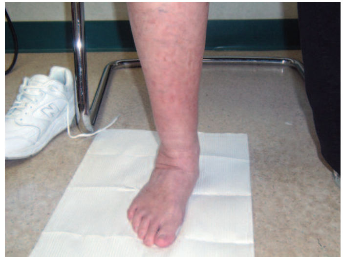
Figure 2. Patient weight bearing, anterior view. Notice marked increase in forefoot eversion, with knee compensated to hyperextension.

This local support can be provided by a biomechanical foot orthotic device. The device will need to be firm enough to control abnormal motions occurring secondary to both ground reaction (bottom up) and external (top down) forces being driven through the foot. Designs and materials will depend on the grade of the PTTD, with more rigid control being required as the degree of PTTD increases.