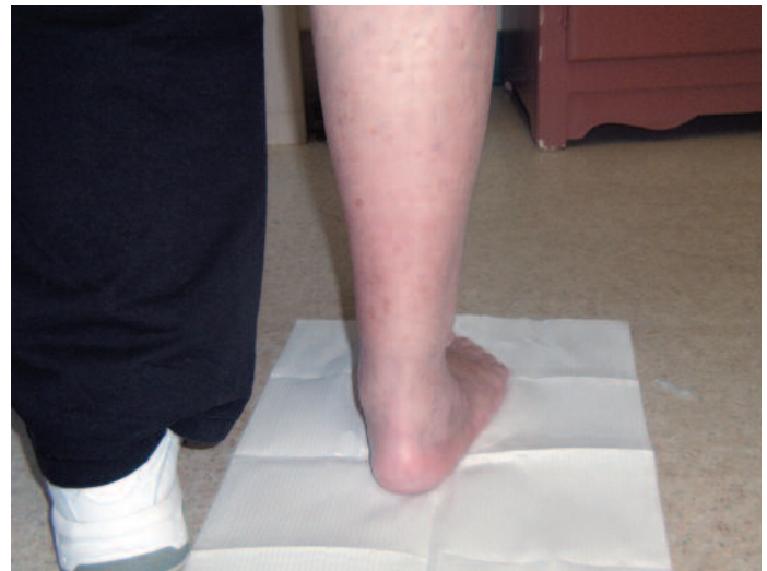
Figure 3. Patient weight bearing, posterior view. Notice increased edema at the Achilles tendon insertion point, too many toes sign common with PTTD Grade 3, and lack of a plantar grade heel, indicating tight Achilles tendon.

For stage I, one could reason that a relatively firm prefabricated foot orthotic shell device would be enough to minimize excessive motions and stresses. 11 For stage II, custom semi-rigid control would be more appropriate. For stage III, a fully functional (rigid) biomechanical foot orthotic device or UCB could be justified to control the stresses that lead to the injury. Finally, for a fixed stage IV, a more accommodative device would be appropriate to conform to the deformity and allow support with maximum pressure distribution on soft tissue.