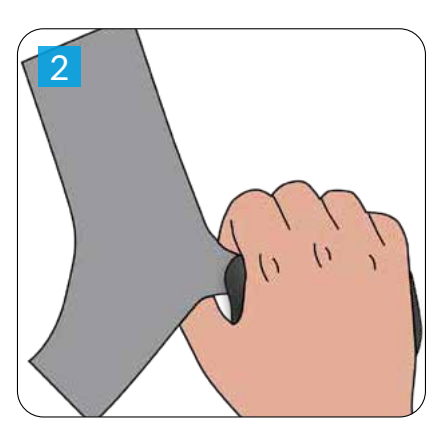
Put the hand on the support.