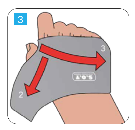
Pull the strap over the hand and attach strap 3 and then strap 2 on the Velcro on the inside of the support. Adjust strap A and B for comfort.